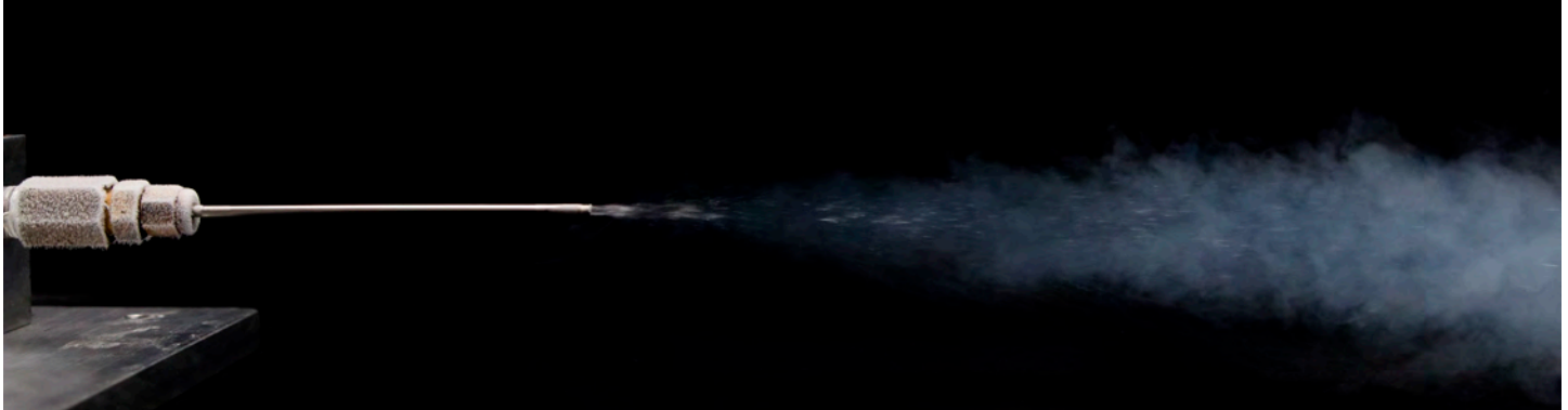
Figure 1: Liquid nitrogen (-196°C) flows through an 18 gauge Insulon® sleeve. Frost collects on the nitrogen supply line while the Insulon® sleeve maintains a dry, touchable surface at 12°C.

Insulon® is a high-performance thermal barrier that effectively eliminates convective heat transfer in a wide range of thermal environments. Offering maximum insulation while consuming minimum design space, Insulon® provides optimal insulation for hypodermic needles used in cryo and steam ablation. The external surface of a 6 inch long, 18 gauge Insulon® sleeve carrying liquid nitrogen (-196°C) reaches steady state at 12°C (Figure 1); a 14 gauge reaches steady state at 15°C (Fig. 3).