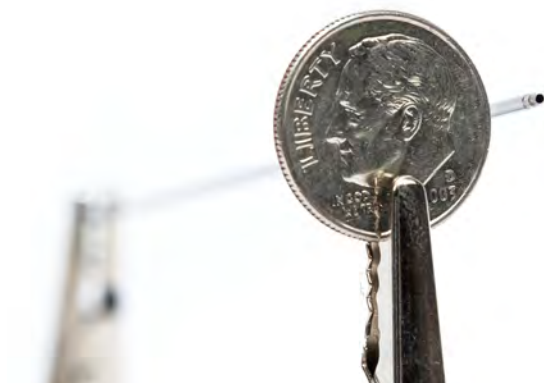
Figure 2: Comparing the size of an 18 gauge Insulon® sleeve to a U.S. dime.

For more information, please call (516) 320-9995 or email us at inquiries@conceptgroupllc.com .